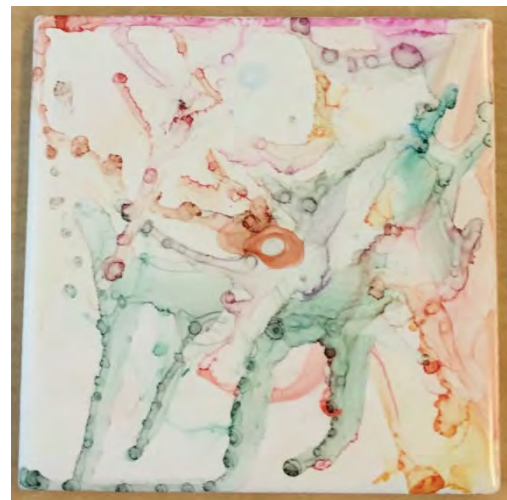
Odysseus pokes out the eye of Polyphemus, The Cyclopes.