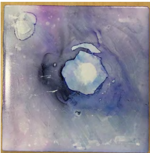
Odysseus and his men must navigate around Charybdis.