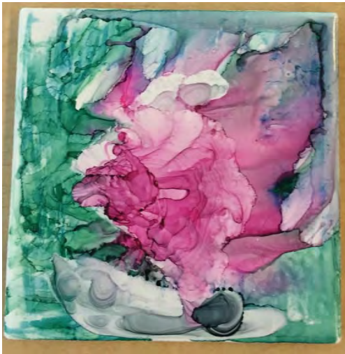
Odysseus's men are enchanted by The Lotus Eaters.