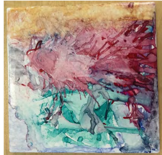
Odysseus and his crew slaughter The Cicones and take their gold.